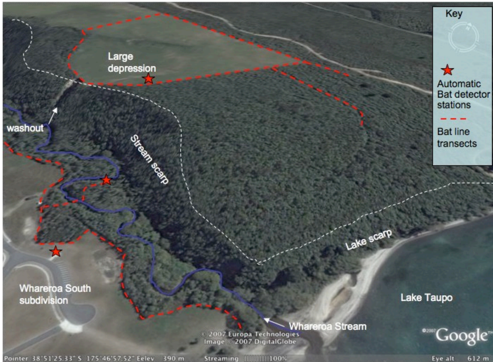
Appendix 1. Locations of long-tailed bat transects at Pt Hauhungaroa 6A block.