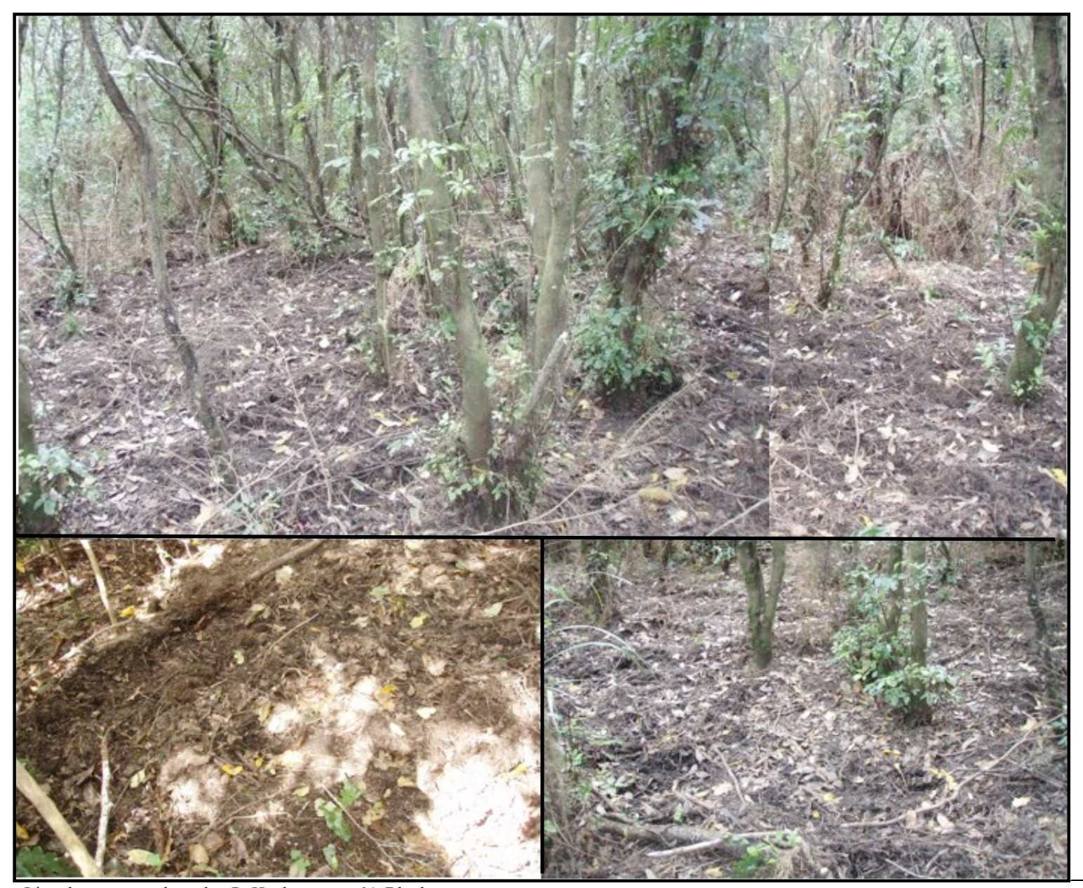
Appendix 4. Photographs of pig damage common throughout Pt Hauhungaroa 6A block.

Lizard survey conducted at Pt Hauhungaroa 6A Block March 2008