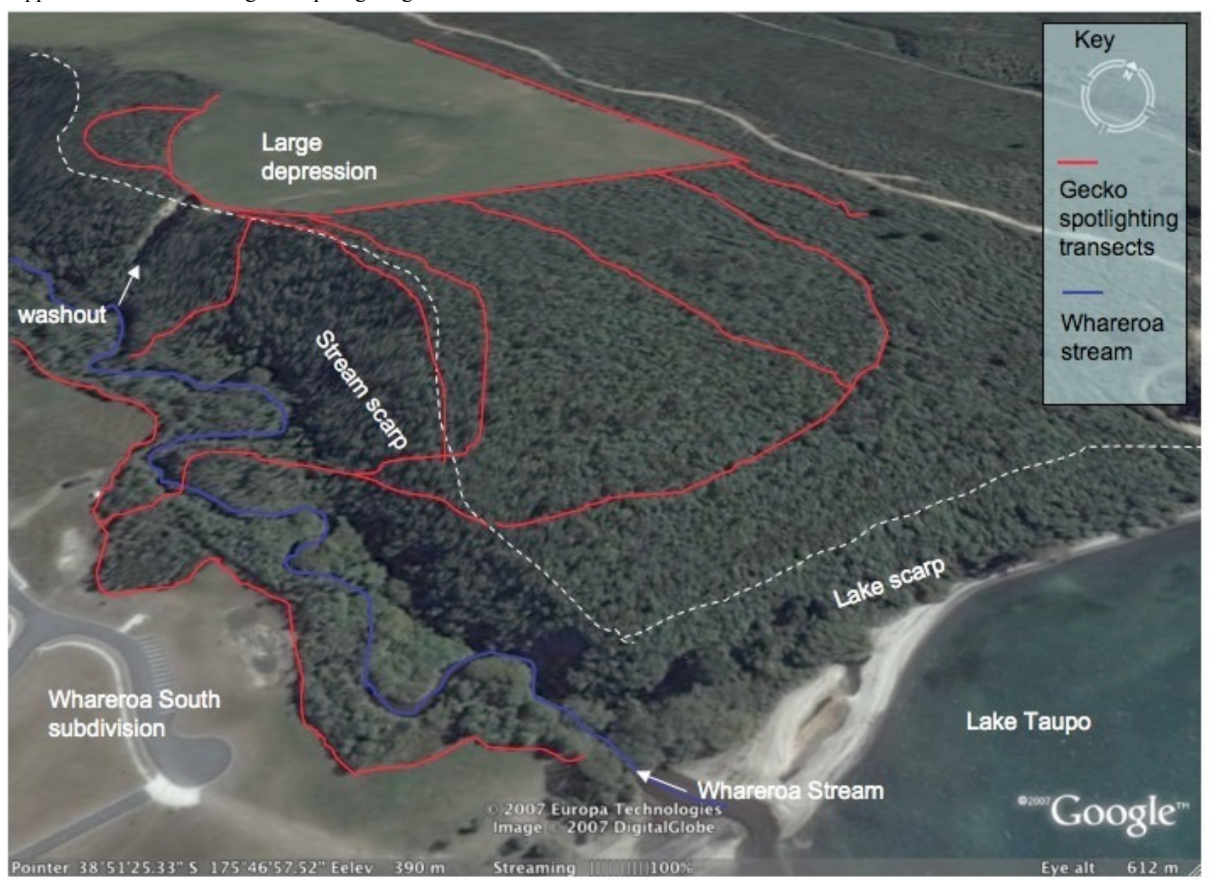
Appendix 1. Locations of gecko spotlighting in Whareroa North.

Lizard survey conducted at Pt Hauhungaroa 6A Block March 2008