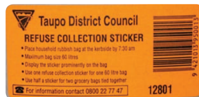
Sample $1.50 orange refuse sticker

You can use half an orange sticker for two supermarket bags tied together. If you have yellow stickers left, you can still use them - just use one and a half yellow stickers per 60 litre bag.